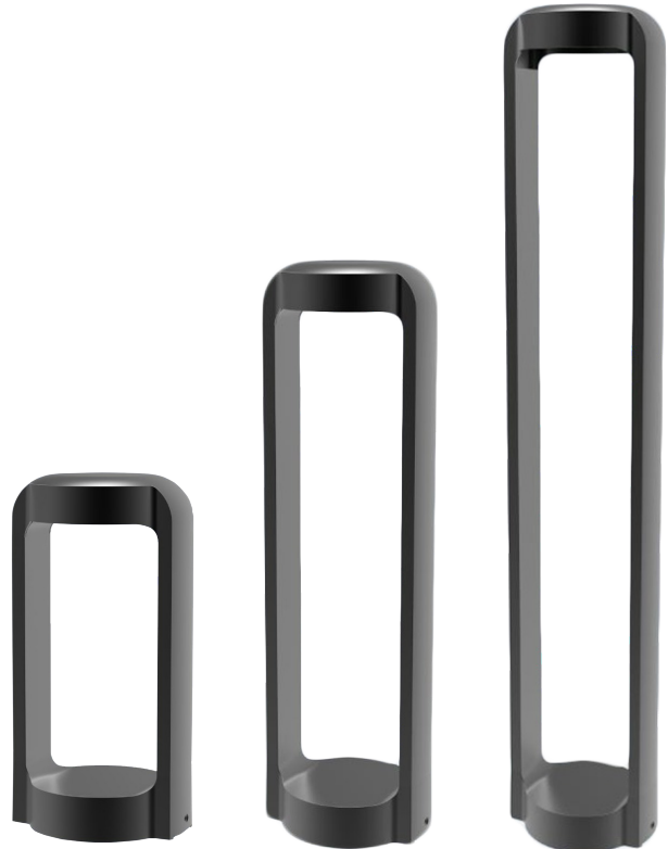
SEKER1 (Bollard Light)